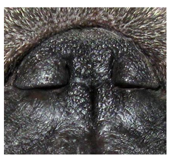
Grade 3 = severe stenosis

(Grading as in Liu et al. 2016. Photos: Liisa Lilja-Maula)