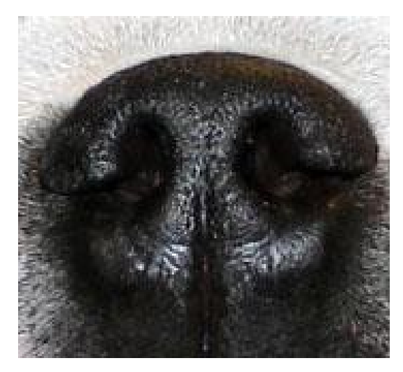
Grade 0 = open nostrils